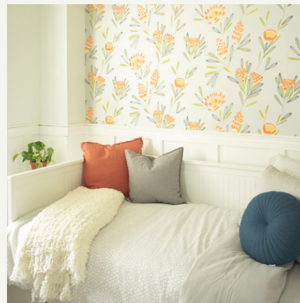
A bedroom and kitchen in Lilac House.