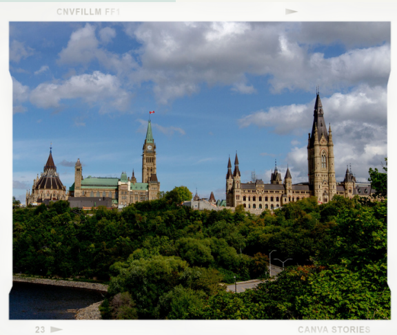
Parliament buildings in Ottawa.

A main focus for Global Family Canada this year is advocacy. GFC staff had the opportunity to attend advocacy training throughout April/May and learn from advocates who work with the UN and the International Justice Mission. We recognize that our child welfare system desperately needs improvement to give every child the chance at a better life, but how can we push for better policies, legislation and systemic change? By creating strong partnerships, and coordinating and collaborating with like-minded groups. We want to be able to not only shed light on systemic problems that put our children at risk, but recommend solutions and best practices to create action. One advocate put it best when she simply said, "Together Possible!". We hope you will join your voice with ours as we advocate for Canadian children.