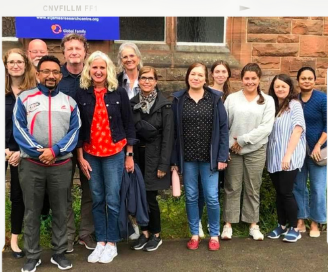
The Global Family Care Network team in Falkirk, Scotland.